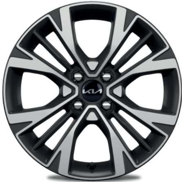
16" ALLOY (X Line)