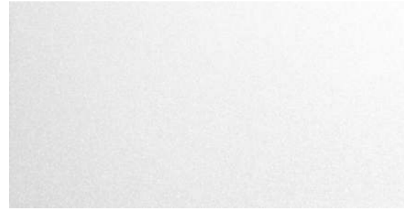
Snow White Pearl