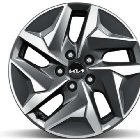
17" ALLOY HYBRID 2WD EX HYBRID AWD EX