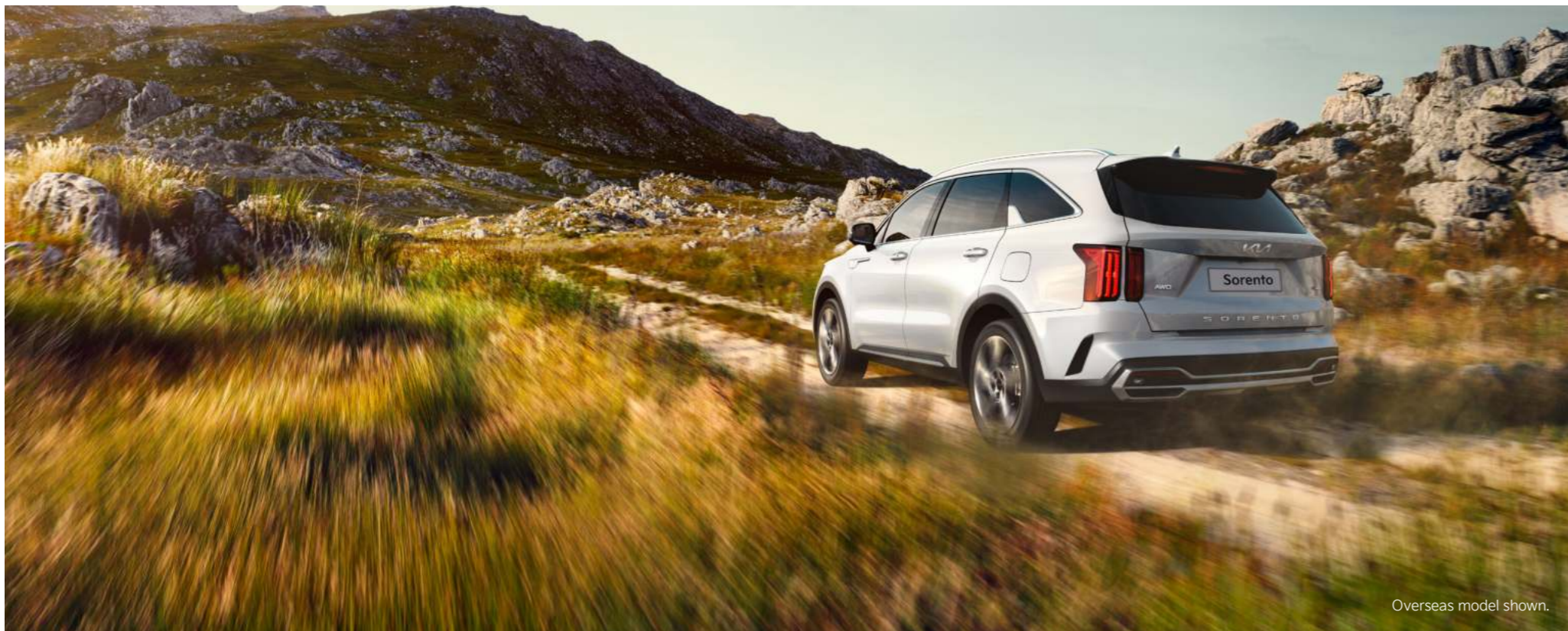
Overseas model shown.