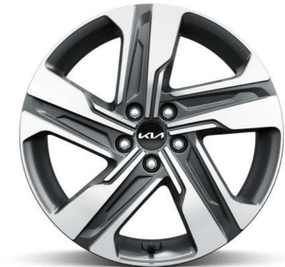
19" ALLOY HYBRID 2WD PREMIUM HYBRID AWD PREMIUM PLUG-IN HYBRID AWD EX PLUG-IN HYBRID AWD PREMIUM