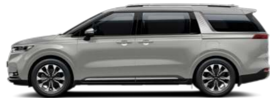
Ceramic Silver (Premium only)