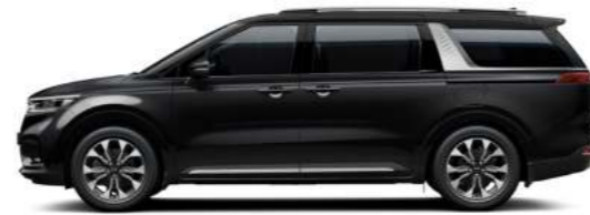
Aurora Black Pearl