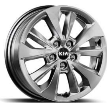
17" Alloy (EX)