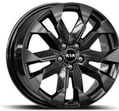
19" Alloy Type B (Premium in Ceramic Silver only)