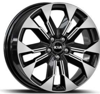
19" Alloy Type A (Deluxe and Premium)