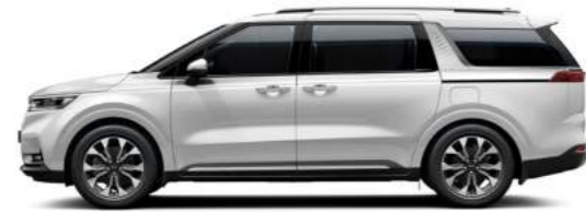
Snow White Pearl